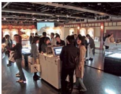
The exhibition in Tokyo