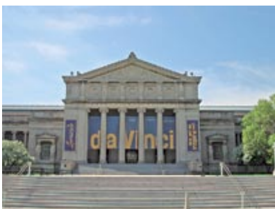
The Museum of Science and Industry in Chicago