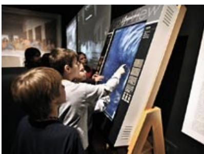
"Da Vinci's Workshop" at Franklin Institute of Filadelfia

Canada: on October 13, the exhibition " Da Vinci's Workshop " opens at Ontario Science Center in Toronto.