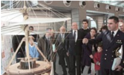
"Leonardo and Flight" at the Museum of Natural History of the Mediterranean in Livorno, Italy

the first time in history. The exhibition presents physical reconstructions, interactive stations and a futuristic holographic mega touch-screen. The opening is attended by the Emir of Qatar and dignitaries from around the world; L3 's work represents the only present-day reconstructions and modern technology to be displayed among the more than 800 antique artifacts exhibited in the museum.