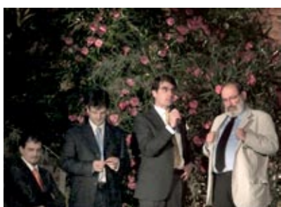
Umberto Eco awards Leonardo3

“Leonardo’s Robots is a wide-ranging and lavish review that comes off as the virtual achievement of a grandiose museum with the most innovative aspects of Da Vinci technology”.