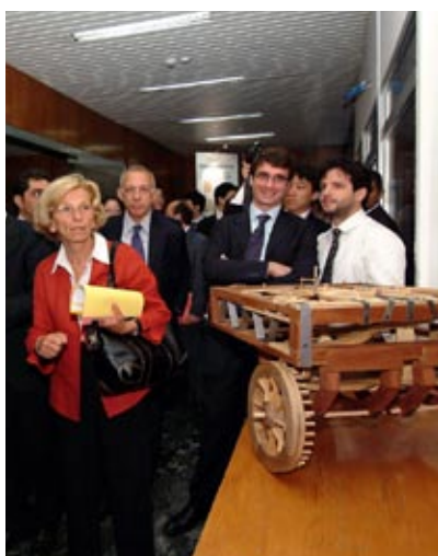
The ICE (Italian foreign trade institute) conference in Rome