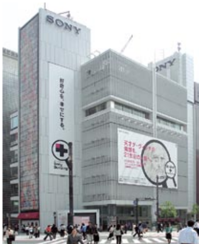
The Leonardo3 exhibition at the Sony Building in downtown Tokyo