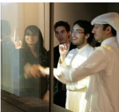
The holographic touch screen used for the Book of Secrets