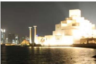
The opening of the Museum of Islamic Art in Doha on 22 November 2008, attended by dignitaries from around the world