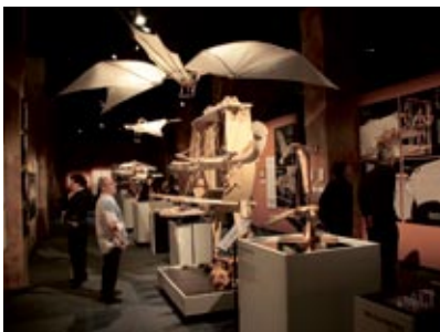
"Da Vinci's Workshop" at Discovery Exposition Center of Times Square at New York

New York, USA: " Da Vinci's Workshop " exhibition opens at Discovery Exposition Center of Times Square (November 21, 2009 - March 14, 2010). The exhibition receives a great review in New York Times and has over 80,000 visitors.