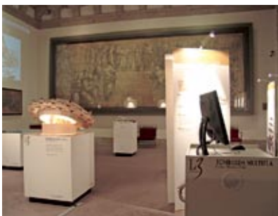
The L3 exhibition in the Raphael Cartoon Room of the Ambrosiana Picture Gallery, Milan