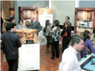
"Os Segredos Dos Codigos de Leonardo da Vinci" at the Museu da Casa Brasileira in São Paulo