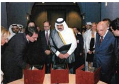
The opening of the show in Qatar with the Emir and Italian President of the Republic Giorgio Napolitano