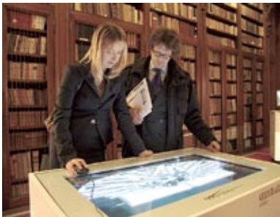
The opening at the Ambrosiana Picture Gallery in Milan