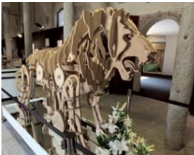
"Leonardo's Workshop in the Ideal City" at Vigevano Castle, Italy

Milan, Italy: Il Libro dei Segreti (The Book of Secrets) is published jointly by L3 and the Gruner&Jahr/Mondadori Group and comes out on newsstands throughout Italy as a supplement to FOCUS magazine.